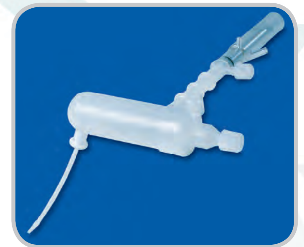
Savillex PFA Inert Sample Introduction Kit

Savillex worked very closely with Agilent to design a PFA inert kit that avoids the common problem of droplet formation in the connector tube, which causes instability and can even extinguish the plasma. The connector tube is an easy push fit design and the end cap is O-ring free to minimize contamination and features a make-up gas port. The demountable torch uses an O-ring mount, which ensures a correct fit with the torch and allows it to be easily dismantled. Injectors are available in either sapphire or Pt, with 2.5mm ID. Versions for organic sample analysis are available, featuring smaller diameter 1.5mm injectors, and a gas port for O2 addition. All parts that come into contact with the sample come precleaned, ready for immediate use. Savillex inert kits are supplied with a genuine Agilent quartz torch and are exactly as supplied as original equipment with both the 7500 and 7700 Series. These kits are the highest performing inert kits available for ICP-MS, and used by all leading semiconductor labs around the world. Choose one of the kits below and add one of the Savillex nebulizers to make a complete inert PFA sample introduction system.