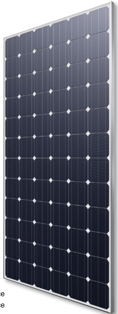
Fig. similar 72M156USA170727A

IP 67 High quality junction box and connector system for a longer life time