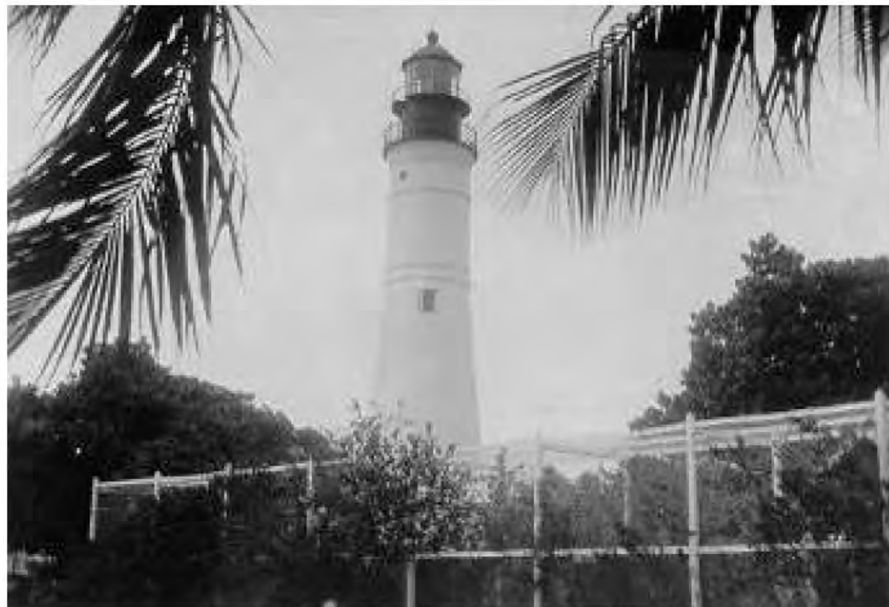
Key West Lighthouse 1894