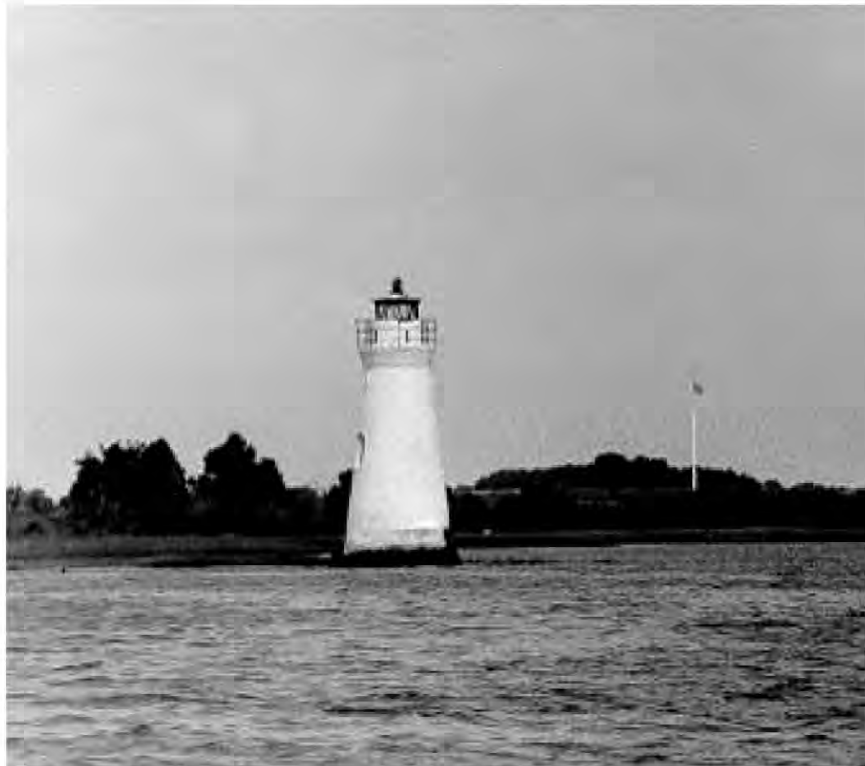
Cockspur Island Lighthouse, Georgia