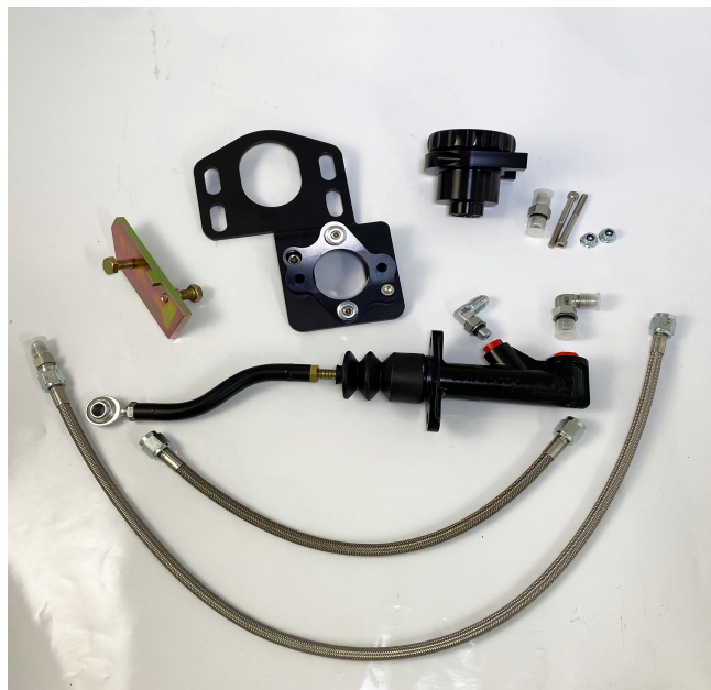
Image shown has billet reservoir

These instructions are to install a hydraulic master cylinder to be used with an external slave cylinder or internal slave cylinder with throw-out bearing. Some modifications of your firewall and pedals are required. This kit does not include pedals or slave cylinder.