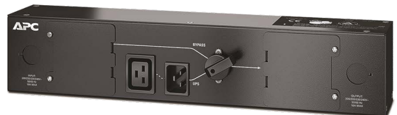
[ SBP3000RM ]

SBP3000RMHW: APC Service Bypass Panel, 100 - 240 V; 30 AMP ; BBM; Hard-wire Input/Output