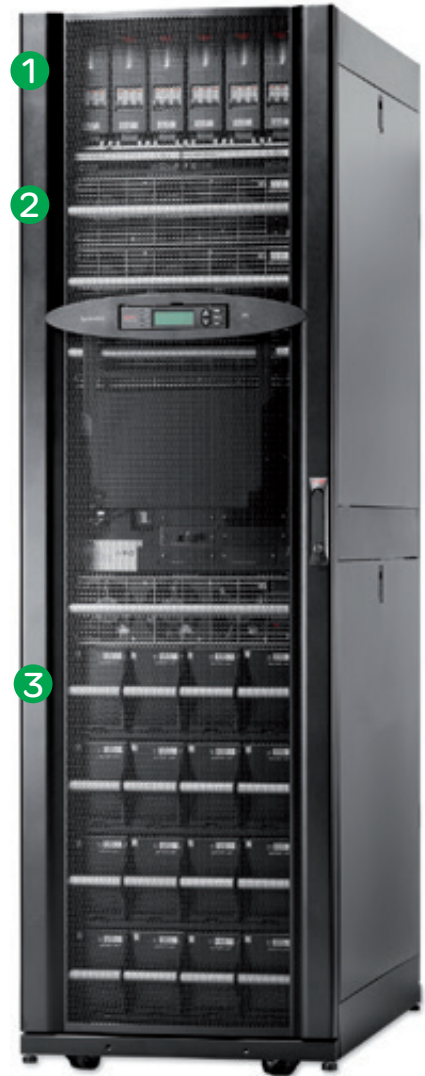
Scalable to 48 kW

Swappable battery modules feature advanced battery monitoring and temperature-compensated battery charging that extends battery life.