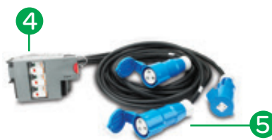
Power Distribution Module with RCD