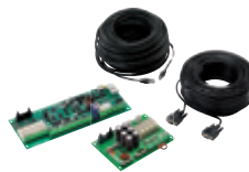
Third-party Switchgear Kit