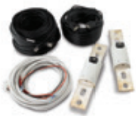
Battery Breaker Enclosure Fuse Kits (500 A and 1000 A)