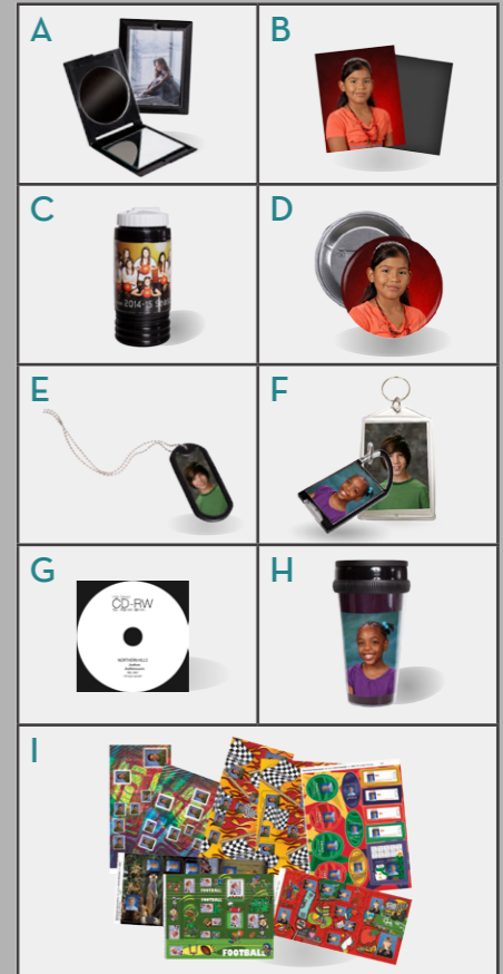
Photo Specialties & Gift Items

Actual Product Appearance may vary from those illustrated