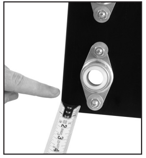
Figure 1. Pillow Block Plate

Each roller unit has two mounting plates- one for the motor enc mounting and one for the pillow block mounting (as shown in figure 1&2).