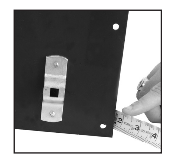
Figure 2. Motor Mounting Plate

Five, six, seven and eight roller plates both of these plates measure: (side B) 29 1/2" wide, (side C) 10 3/4" high.