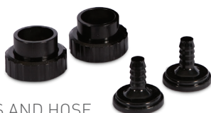
UNIONS AND HOSE BARB ADAPTERS

With 1½" union fittings, the Hayward Booster Pump is easy to install and remove. Its ¾" hose barb union adapters and flexible hose make retrofitting in existing pool pads simple.