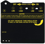
124T1952 Insulator for Double-Pole Time Switch (T103, T104, T105, T173, T174, T175, T176, T185, WH40)