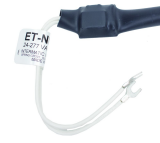
ET-NF RC Snubber Noise Filter 24-277VAC/DC for Electronic Controls