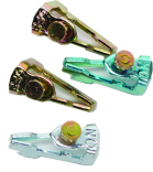
156T1978A Extra/replacement trippers 1 ON and 1 OFF