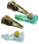
156T1978A Extra/replacement trippers 1 ON and 1 OFF