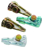
156T1978A Extra/replacement trippers 1 ON and 1 OFF