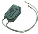
WG1573-10DMX 208-277 VAC, 60 Hz Motor for T102, T104, T106, T172, T174, WH40