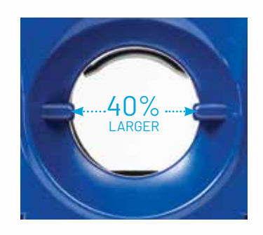
Large Vacuum Intake 40% larger vacuum intake for maximum debris removal