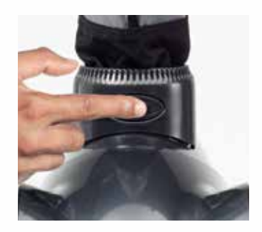
Snap-On Bag Debris bag designed for easy removal and replacement