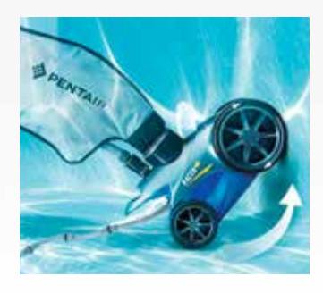
Steady-Grip Traction Front-wheel drive provides greater floor-to-tile cleaning