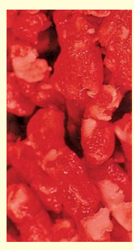
1/8" (3.5 mm)