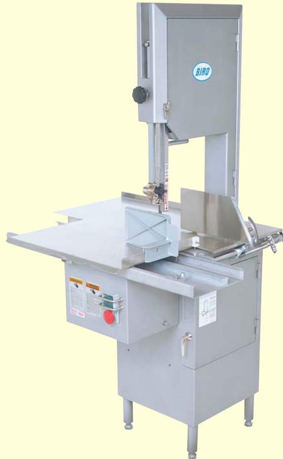
Md. 1433FH (fixed head structure) right to left feed, movable front carriage, stationary rear table.