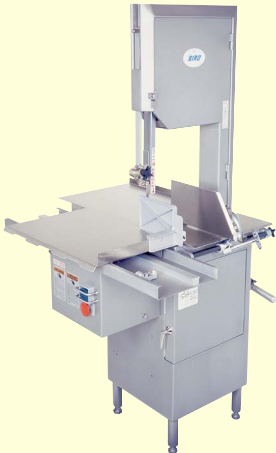
Md. 1433 standard configuration, movable head structure, right to left feed, stationary rear table.