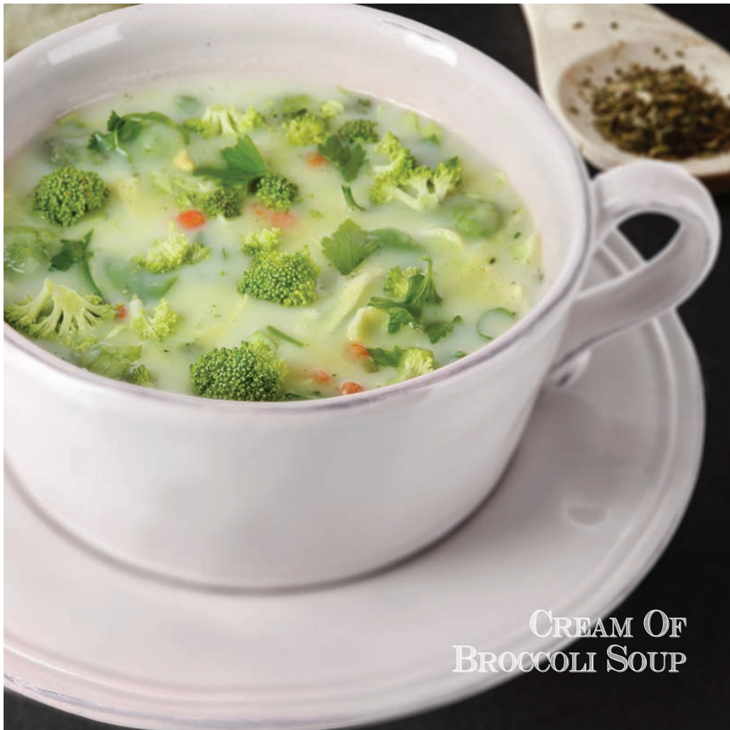
CREAM OF BROCCOLI SOUP