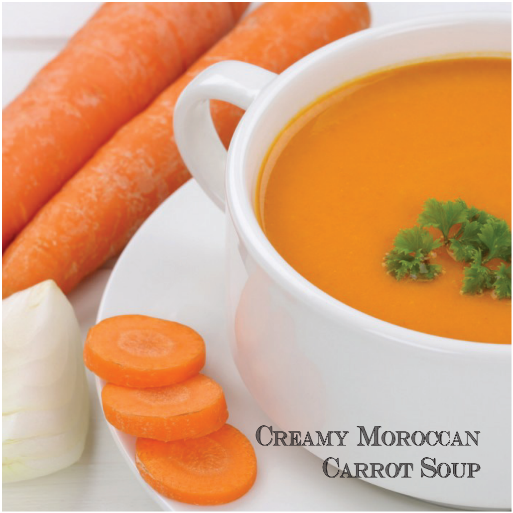
CREAMY MOROCCAN CARROT SOUP