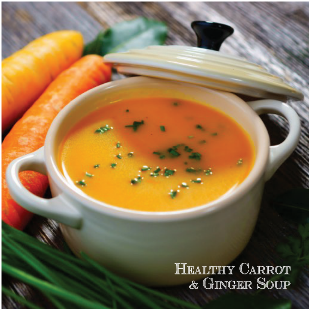
HEALTHY CARROT & GINGER SOUP