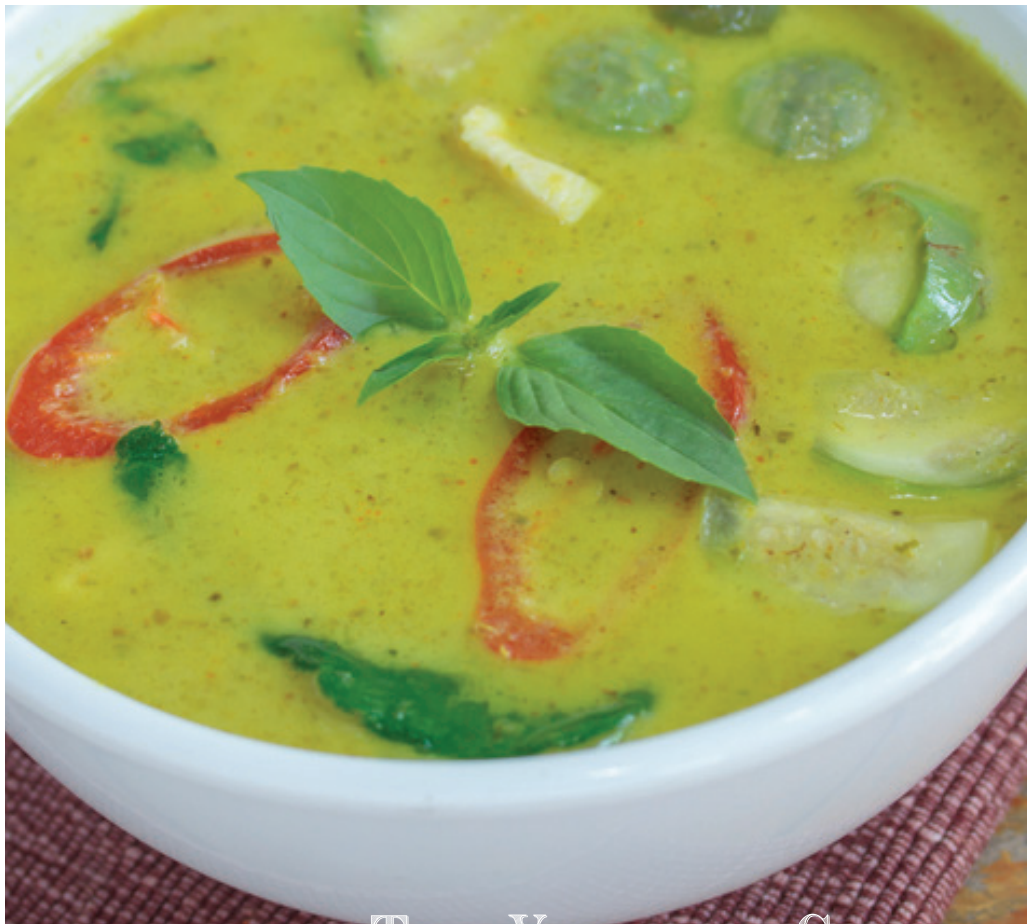
THAI VEGETABLE CURRY