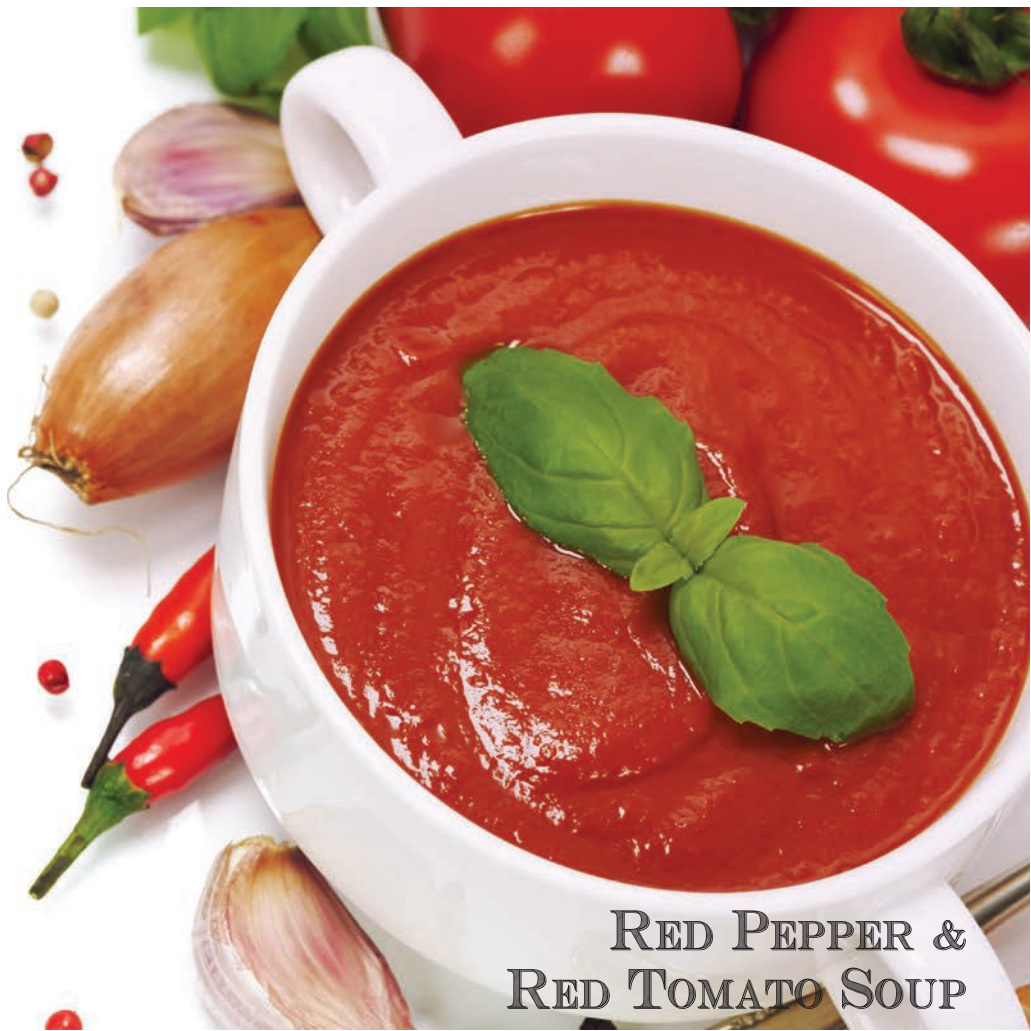
RED PEPPER & RED TOMATO SOUP