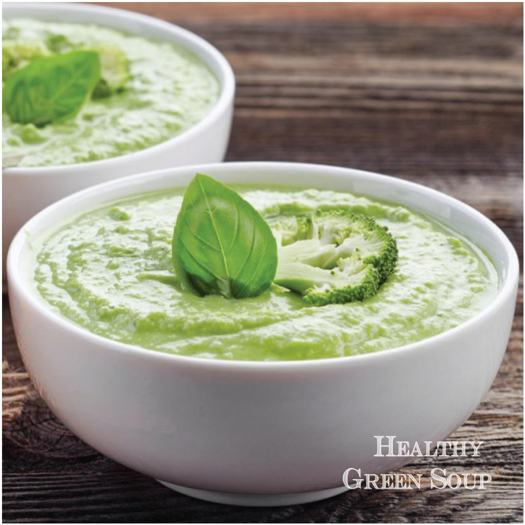
HEALTHY GREEN SOUP