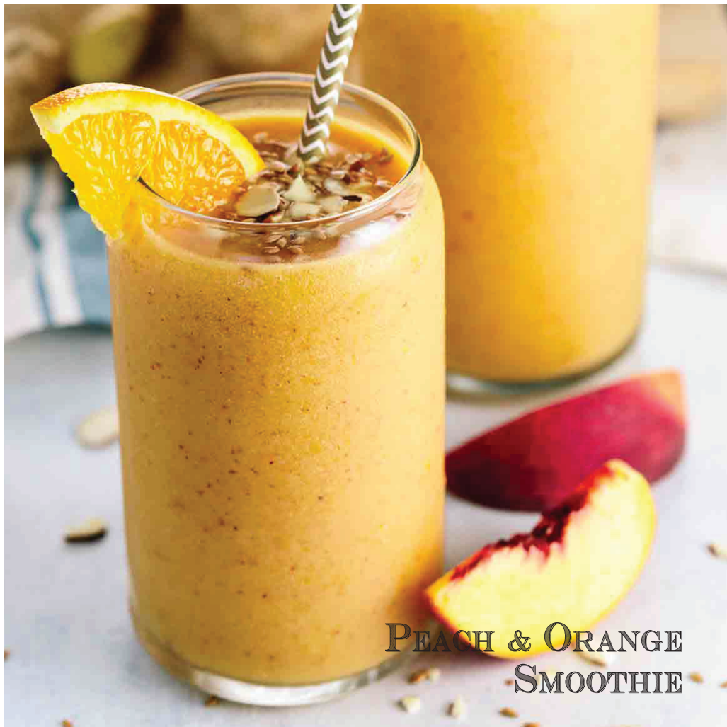
PEACH & ORANGE SMOOTHIE