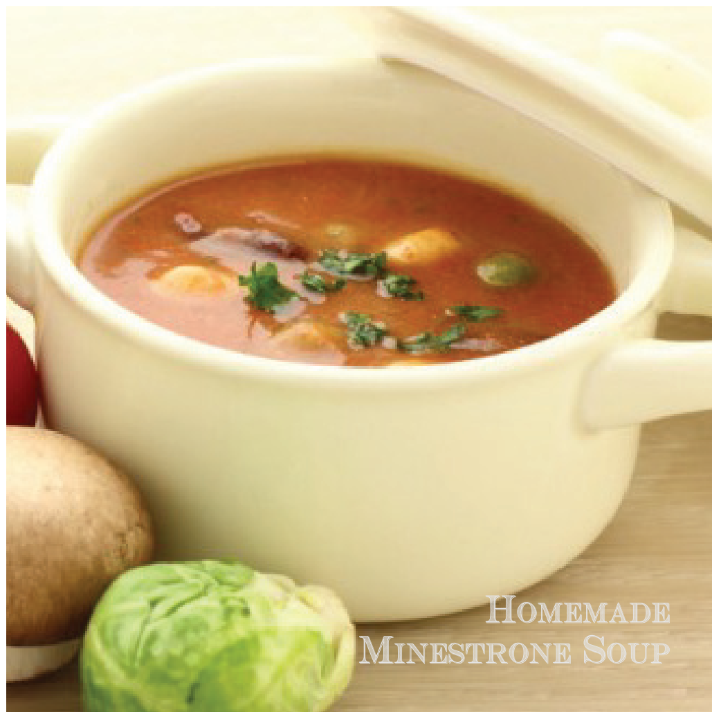
HOMEMADE MINISTRONE SOUP