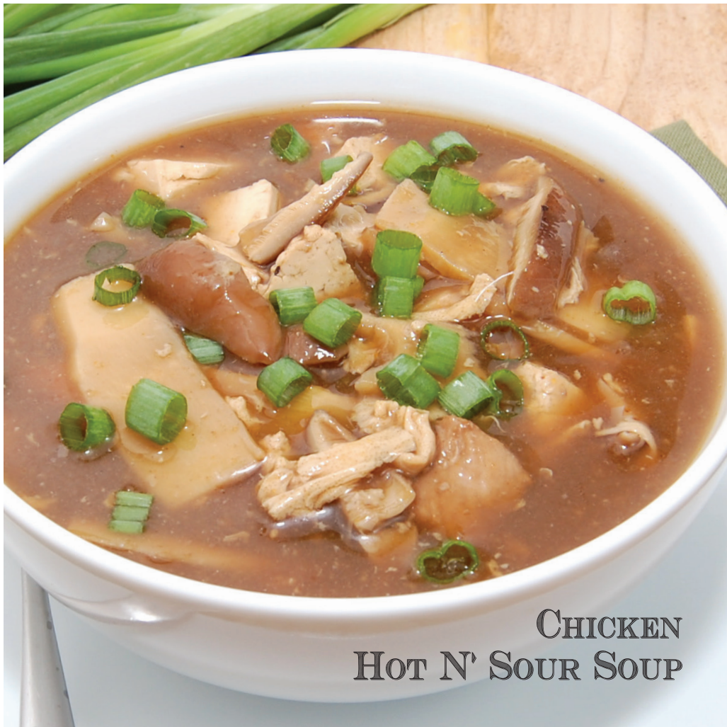
CHICKEN HOT N' SOUR SOUP