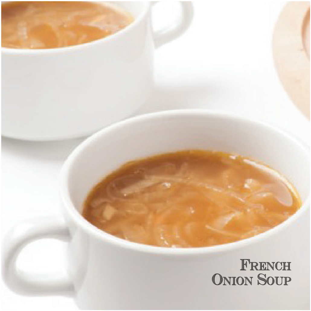
FRENCH ONION SOUP