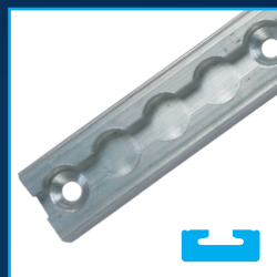
FE750NA100-04-3 Regular Series L-Track Pre-Drilled