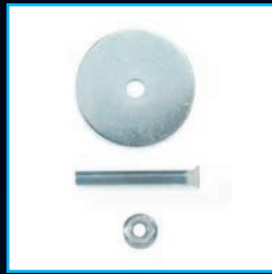
FE201006 5/16" (8mm) Track Bolts

Bolts are 3" (76.2mm) long with automotive grade plating and a special sealant is applied under the bolt head to provide a seal between the track and the bolt.