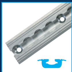
FE753NA100-04-3 Flange Series L-Track Pre-Drilled

Designed for agencies that require total flexibility in a mixed-brand environment, the OMNI line takes the guess work out of securing your passengers.