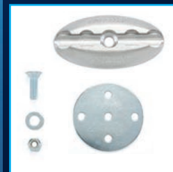
Q5-7571-A Oval L-Pocket