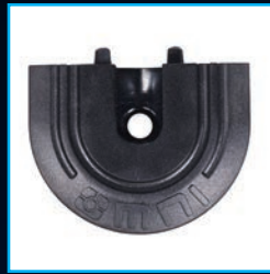
QC06058 End Cap for Flange Series L-Track

These L-Track End Caps finish off your flush-mount flange series installation for a professional look.