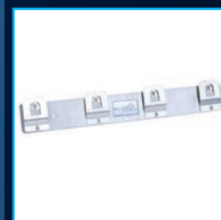
Q5-8525-SC Slide 'N Click Stowage Bracket