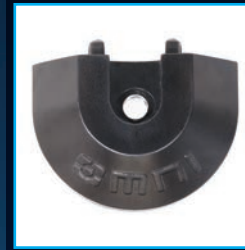
QC06059 End Cap for Surface Angled Series L-Track

They feature a tapered edge to minimize snags and catches on the track edge.