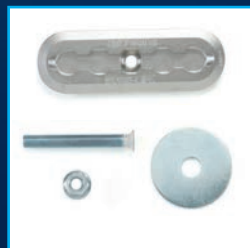
FE201163 Flush Mount L-Pocket