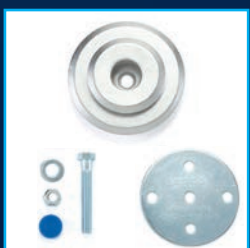
Q8-7580-A Slide 'N Click Floor Anchor