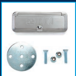
Q5-7570-A Recessed L-Pocket with Cover