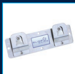
Q5-8525-SC2 Slide 'N Click Stowage Bracket