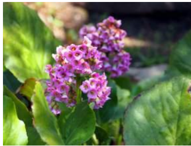
Bergenia cordifolia 'purpurea'