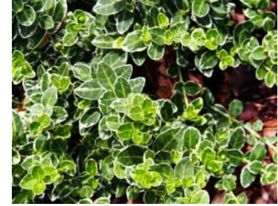
Euonymus f. 'emerald gaiety'