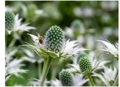
Eryngium 'blauer zwerg'