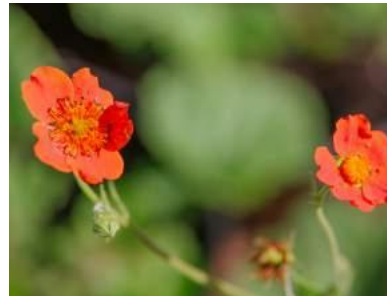
Geum 'Mrs. J. Bradshaw'