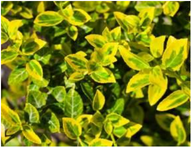
Euonymus f. 'emerald n gold'