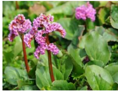
Bergenia 'baby doll'