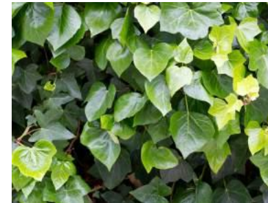
Hedera helix 'green wonder'