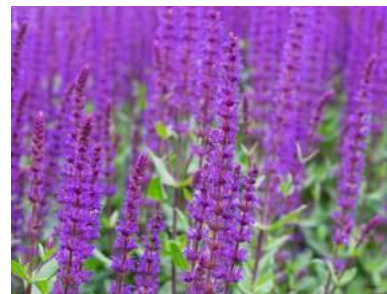
Salvia nemorosa 'caradonna'