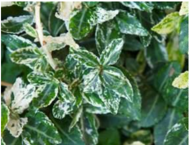
Euonymus f. 'harlequin'