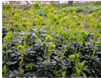
Euphorbia var. robbiae