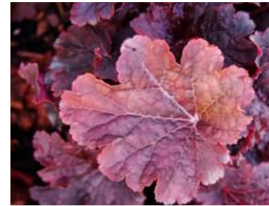
Heuchera 'fire chief'