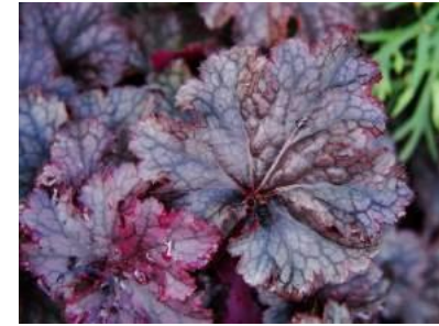
Heuchera 'key lime pie'