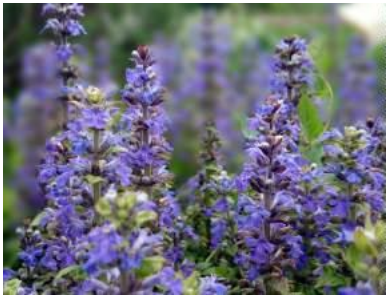
Ajuga reptans 'burgundy glow'