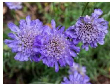
Scabiosa 'blue note'