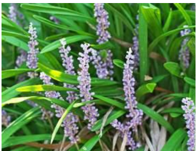
Liriope muscari 'big blue'