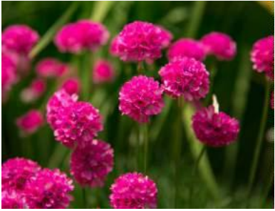
Armeria splendens 'maritima'