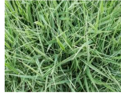
Carex 'ice dance'