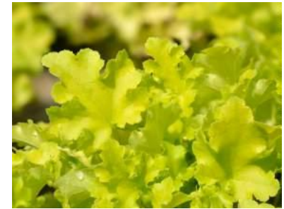
Heuchera 'key lime pie'