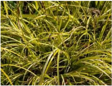
Acorus gramineus 'ogon'