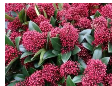
Skimmia japonica 'Rubella'