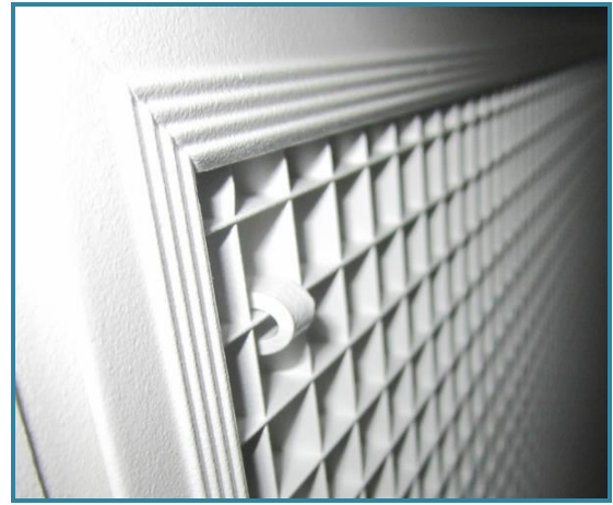
(View from inside the unit.)

Shift the drip tray over so that the 'J' hook will hook onto the inlet grill and lower the drip tray in place.