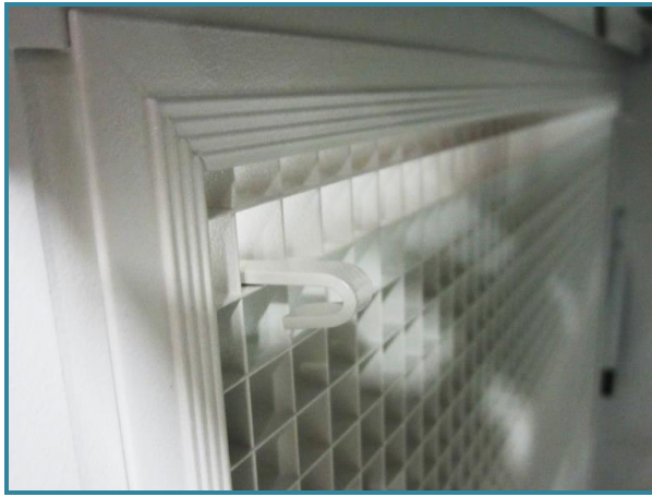
(View from inside the unit.)