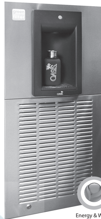
Energy & Water Conservation Model