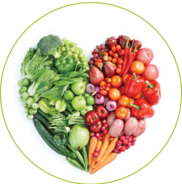
IMAGE Skincare believes beautiful skin is healthy skin. In order to achieve beautiful healthy skin, an easy 3 step Age Later™ program of Diet, Exercise, and Maintenance will deliver ingredients to the skin daily for optimal skin health.

The DIET will consist of an array of highly active ingredients designed to exfoliate, even out skin tone, build collagen, moisturize, protect, prevent, correct and nourish all layers within the skin. The goal is to create a skin care regimen encompassing all the ingredients found on the Image Skincare Diet wheel (opposite page). The multi-functional qualities of many Image Skincare products allow the creation of such program in just 4 simple products to take home. The skin needs a daily dose of these ingredients to deliver maximum nutrition for maximum benefits.