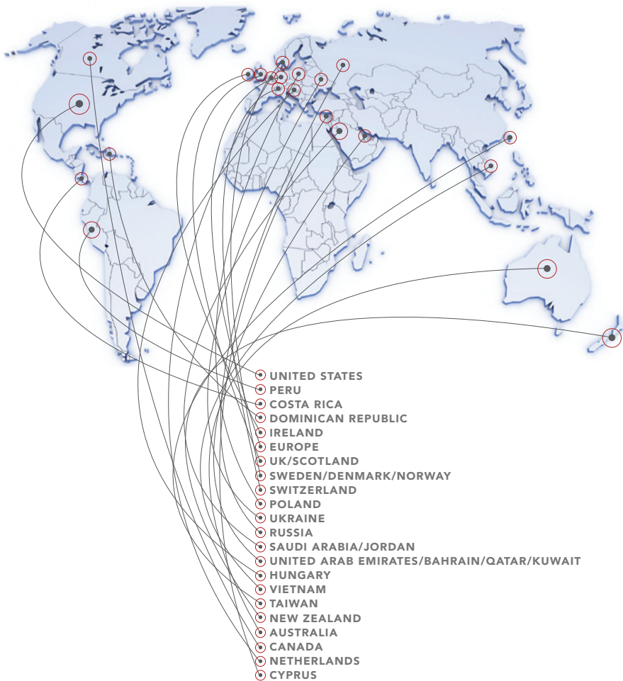
Image Skincare products are sold in many countries throughout the world. We have Image Aesthetic training centers in Canada, Europe and the Middle East and new locations will open in Australia, China and South America. During the year of 2011 Image Skincare will be available in 40 countries.

For a complete list or a location near you please call our corporate headquarters at 1-800-796-7546.