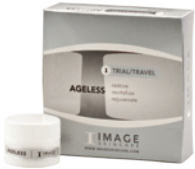
Image Skincare offers clients different options to get started with Image products: One week TRIAL KITS are excellent to try and travel with. The KITS consist of up to 5 products with an easy cook-book approach of usage. These KITS are available as:

AGELESS ANTI-AGING KIT RESTORE - REVITALIZE - REJUVENATE A KIT designed for aging and environmentally damaged skin. The products in this KIT minimize the appearance of fine lines and wrinkles, leaving the skin youthful and radiant.