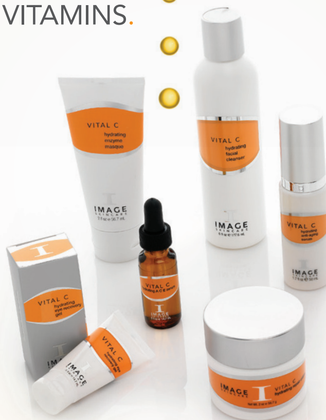
Image Skincare Vital C line feeds your skin with essential vitamins A, C and E as well as anti-oxidants nourish to create a healthy, luminous glow.

Image Skincare products are available exclusively through licensed physicians and aestheticians.