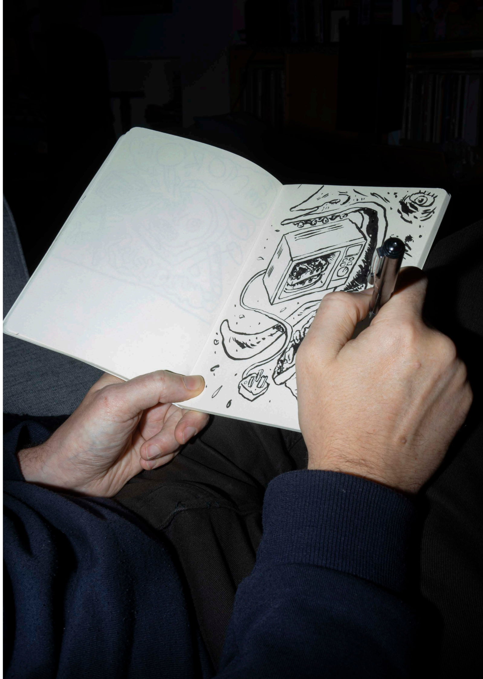
CASEY RAYMOND, ILLUSTRATOR / FILMMAKER