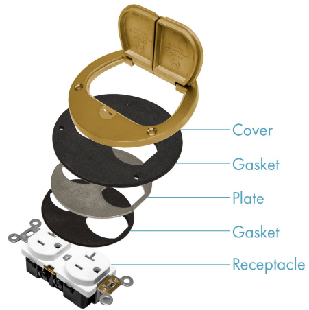
Complete Kit Assembly