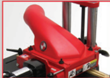
Model 209 Molder PATENTED