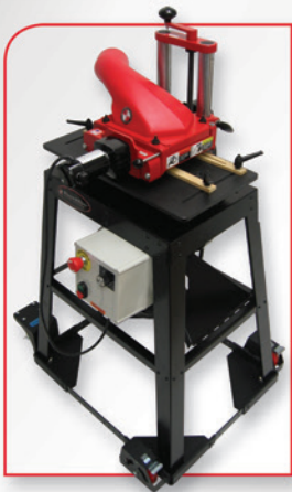
Model 206 Molder with Optional Mobile Base PATENTED