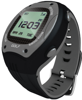
ScoreBand Golf GPS Watch Model #: SB-GPS1 www.ScoreBand.net