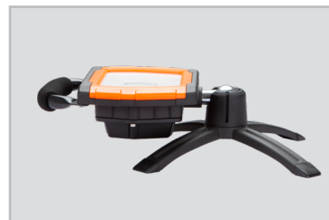
Tilt & Swivel to 360°