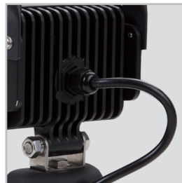
Finned design offers excellent heat dissipation