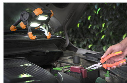
Quick repairs under the hood