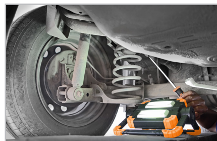
Best suitable for vehicle underbody maintenance