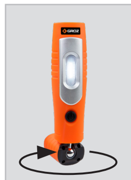
Fully flexible 360° swivel & tilt design with unique ball joint