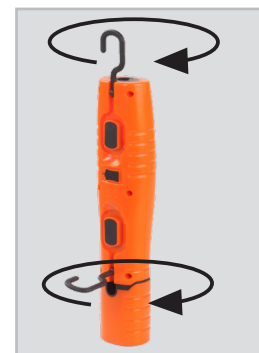
2 fold out 360° swivelling hooks for easy installation