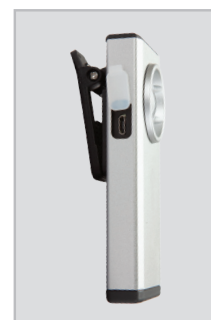
USB charging port protected by rubber bezel