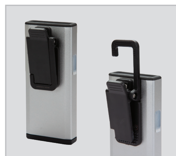
Pocket clip with integrated hook