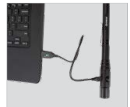
USB Charging: Simply connect the light to wall charger, laptop etc. for convenient charging