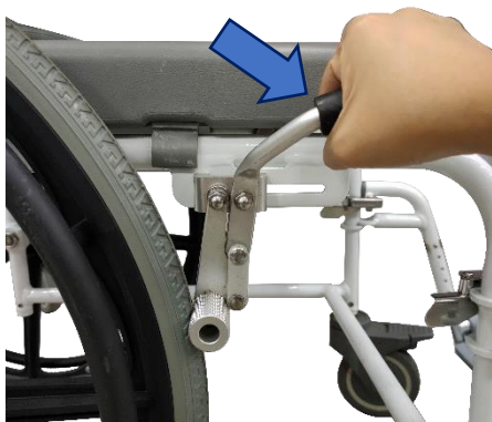
Push forward to put on the brake