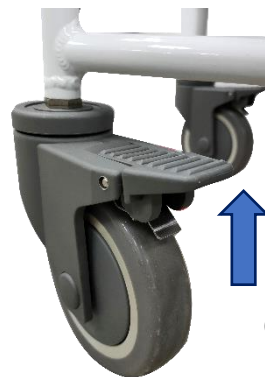
Castor is unlocked