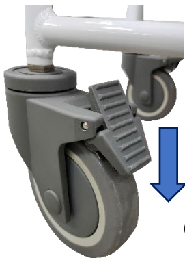
Castor is locked