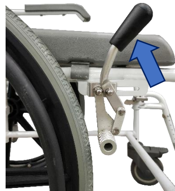
Pull backward to release the brake