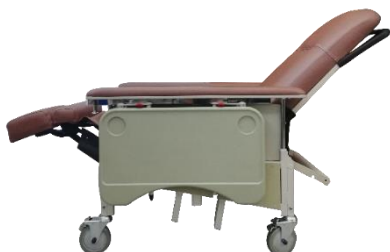
Recline Position 2