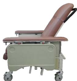
Recline Position 1

To return to seated position: To bring recliner back to the seated, no. 1 or no.2 position, lift the lever, slowly guide the back, up fully and release the lever. Return patient to desired position by pushing upward on padded push handle.