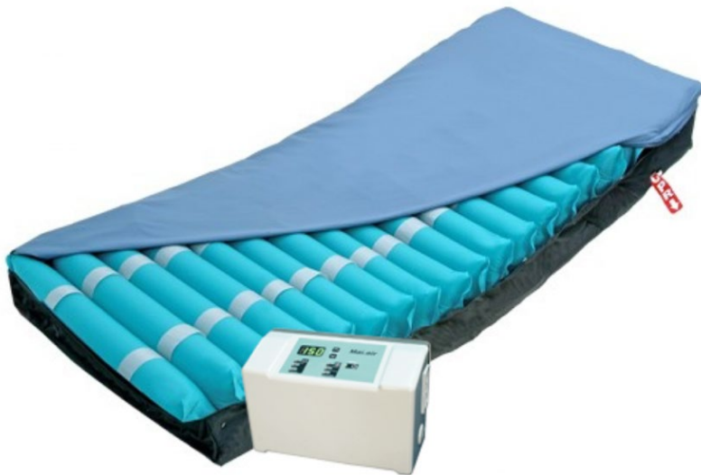
Alternating Cycle A-B-C