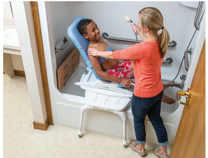
4. In the final position the bath chair is over the tub and can be adjusted as desired for showering.