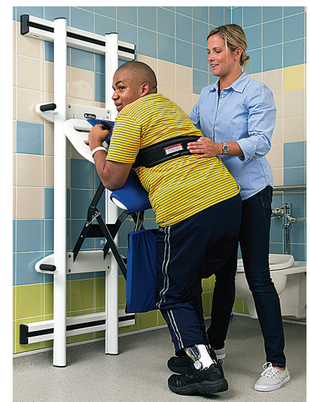
With the kneeboard in use, adjust the trunk board angle to a more upright position to promote increased weight-bearing.