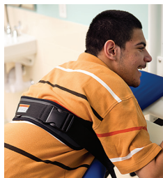
The support strap provides additional security during hygiene care.