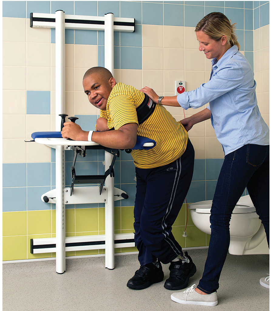
The elbow curves enable a user with limited hand function to assist in a transfer and maintain position on the trunk board.

Beyond toileting: The Support Station can ease the sit-to-stand transition in any setting. Clients can self-assist the stand-pivot transfer from wheelchair to adaptive chair or support themselves in an upright position for clothing changes prior to a swim session.