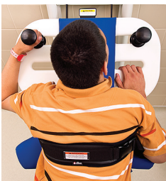
Handholds and slots in the trunk board enable the user to assist in a transfer.