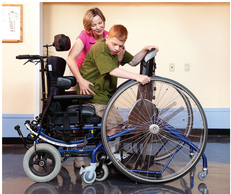
The wide, accessible deck makes transfers easy.