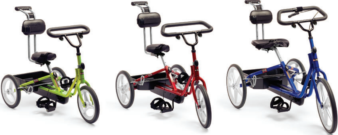
All three sizes are available in four colors: red, blue, pink and lime.