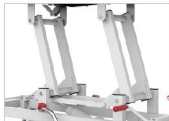
TWIN LIFT Strong twin-lift mechanism ensures rigidity and stability during treatment.