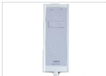
HAND SWITCH Utilizes a high-grade electric actuator driven enable full adjusted product hi-lo.