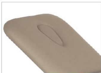
BREATH HOLE Equipped with breathing hole.