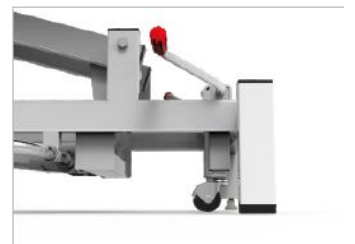
LOCKING SYSTEM Fitted with retractable casters and central lock for easy mobility.