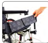
Detachable knee support