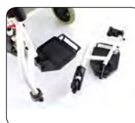
Detachable swing away footrest