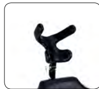
Angle adjustable headrest