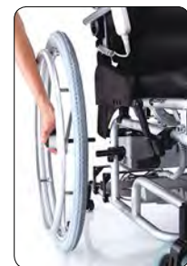
Rear wheel with quick release axle