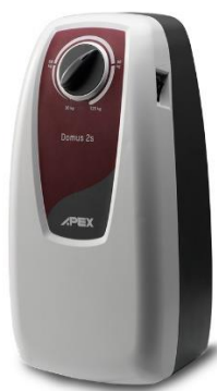
Weight indicator reference to facilitate optimized pressure setting