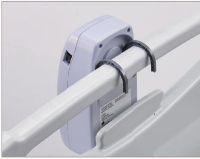
Adjustable hangers suitable for most bed end panels