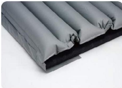
Extension flaps can be tucked under the standard mattress for stabilisation