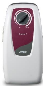
Weight indicator reference to facilitate optimized pressure setting