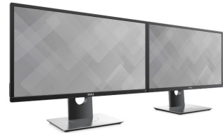
Dell 24 Monitor P2417H (dual set up)