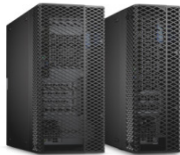
Dell OptiPlex Tower or Small Form Factor Cable Cover