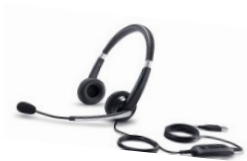
Dell Pro Stereo Headset UC350