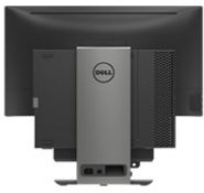
Dell OptiPlex Small Form Factor All-in-One Stand