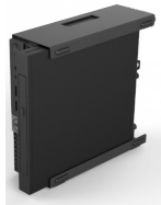
Dell OptiPlex Micro DVD+/-RW Drive Enclosure