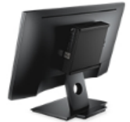
Dell OptiPlex Micro All in One Mount for E-Series Displays