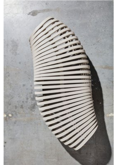
Ribs Bench Outdoor moved into various positions.