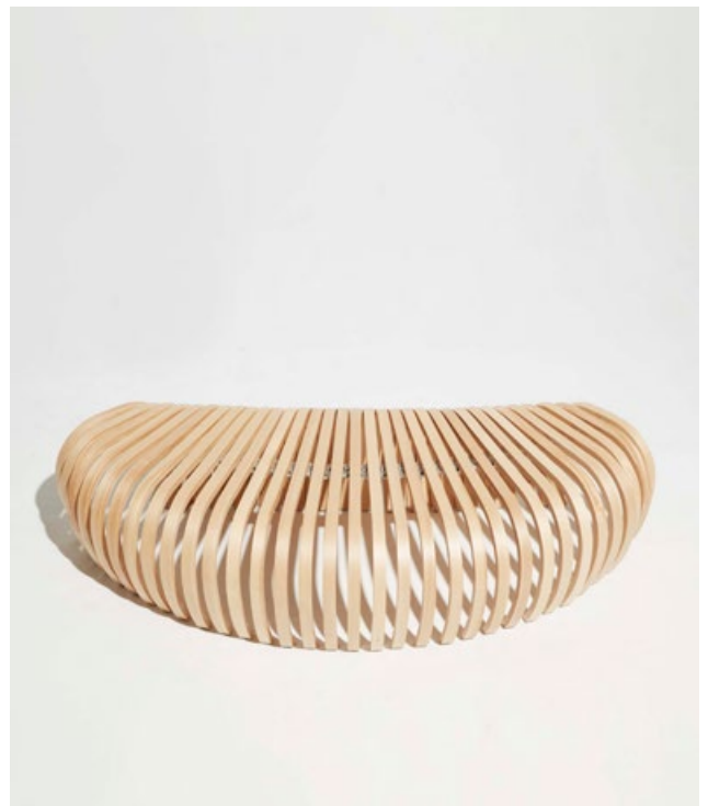
Ribs Bench moved into various positions.