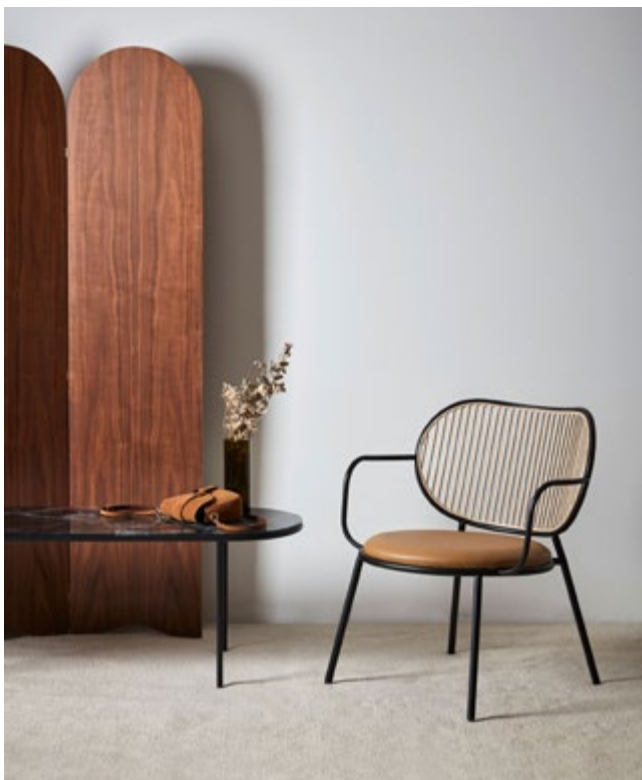
Piper Lounge Chair with leather upholstered seat pad (HL1 - Leather Primary Butter).