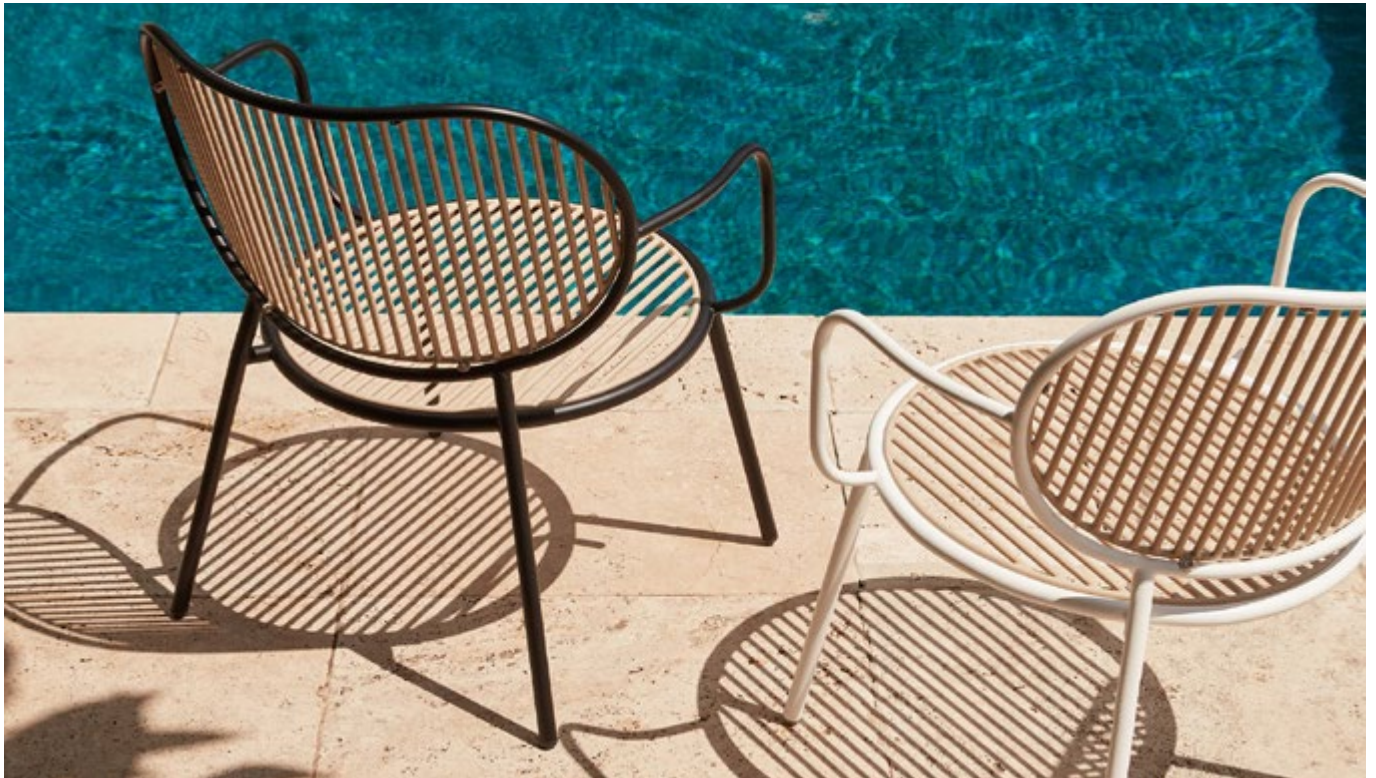
Piper Lounge Chair, powder coated stainless steel frame and inserts.