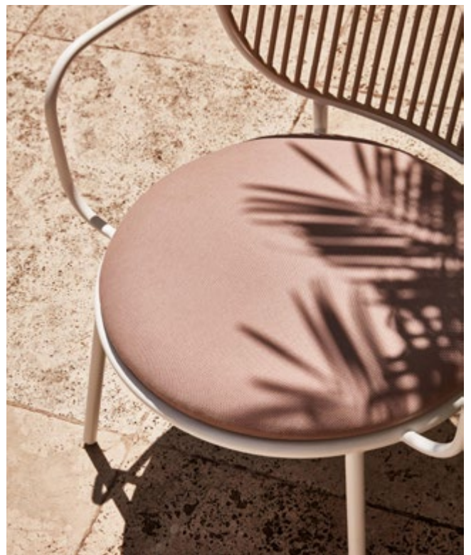
Piper Lounge Chair with outdoor fabric upholstered seat pad (HF3 - Kvadrat Maharam Patio 0340).