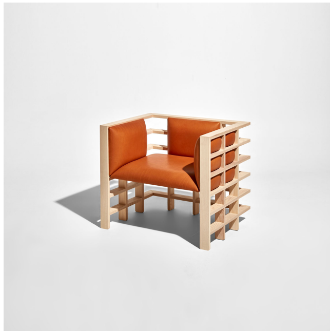
Mochi Armchair with leather upholstery.