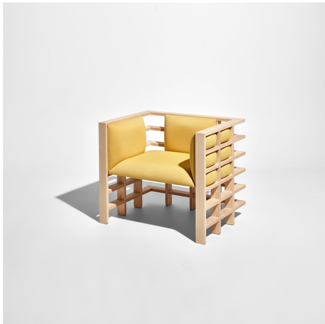
Mochi Armchair with fabric upholstery.