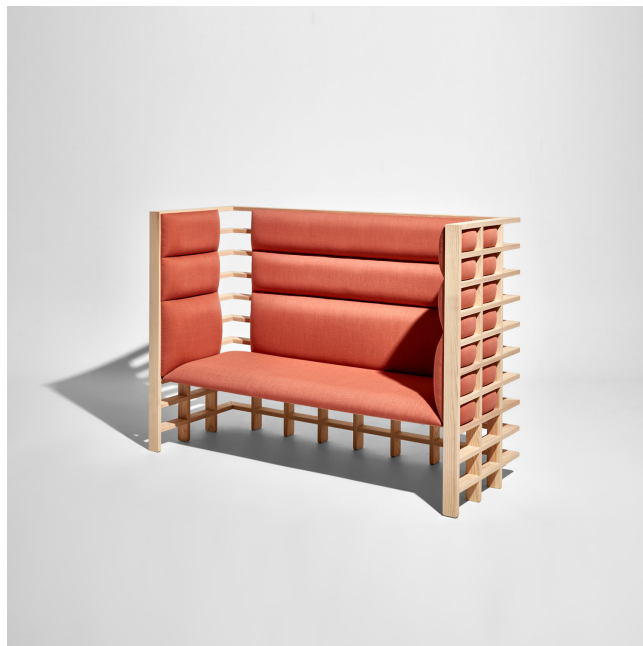
Mochi Booth with fabric upholstery.