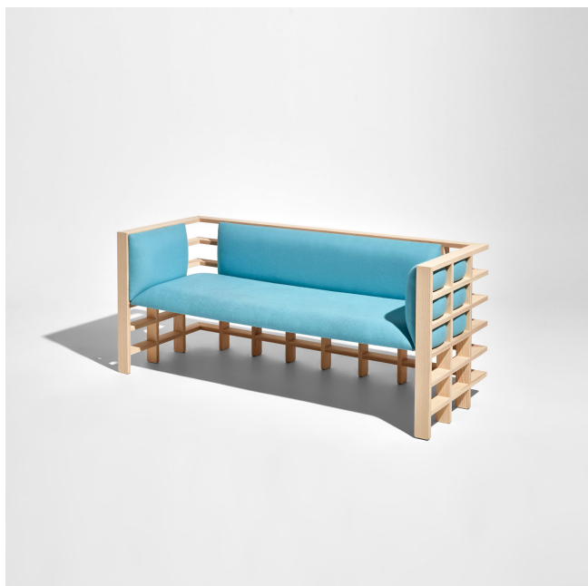
Mochi Lounge with fabric upholstery.